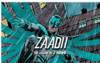
Zaidi’s Unfinished Story: The Legend of Z-Hawk

Each day nine people are killed by distracted driving, leaving their stories unfinished. Travelers Insurance produced four excellent animated videos about real people who lost their lives to distracted driving, bringing an unfinished story to life through imagining what could have been. Showing these videos in your driver education class could inspire some meaningful discussions, in class and online. Visit: https://www.travelers.com/resources/auto/distracted-driving