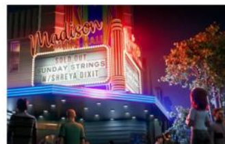
Shreya’s Unfinished Story: The Stage