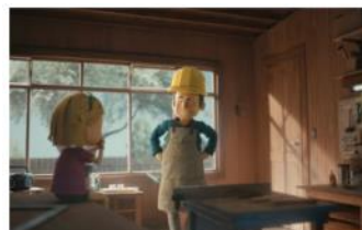
Howard’s Unfinished Story: The Tree House