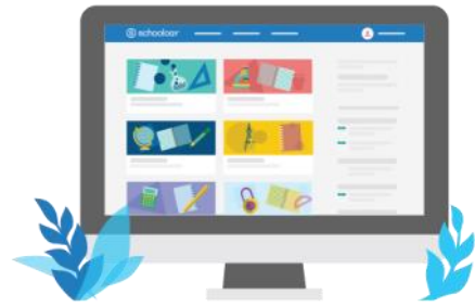
Schoology: A learning management system— schoology.com

Virtual Classes: Personally I use whatever resources our school has purchased. Last spring, I used MOODLE, ZOOM, and REMIND, which helped foster my students’ learning safely and effectively for in-class instruction. I am currently using a “hybrid model” for all my classes through a program called SCHOLOGY, a virtual learning program designed and powered through Power School. This works well for students who are in class and online because I can stream my classes live through Schoology using conferences, all materials and testing can be done live, and the students that are home can interact with the students in class through my smart board.