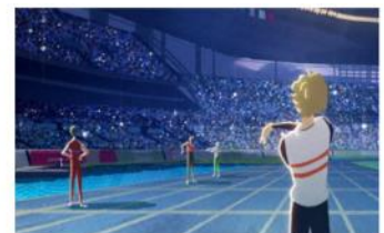
Phillip’s Unfinished Story: The Route